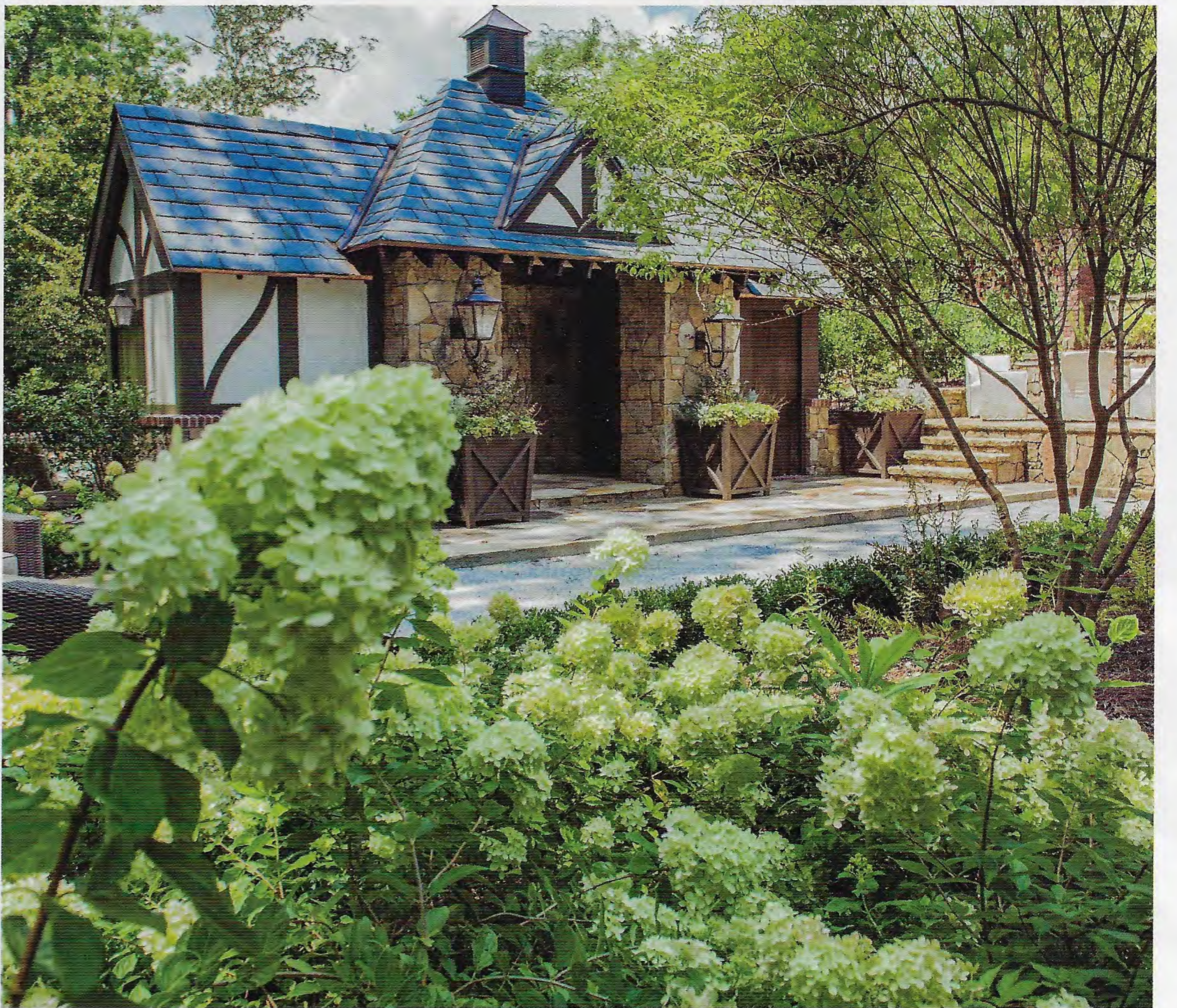
CLOCKWISE FROM TOP: An outdoor dining table from Restoration Hardware with chairs by Ballard Design provides a spot for meals on the terrace near the main house. An existing ravine area was terraced and filled to create a Bocce court with an elevated sitting area above. Cedar rafter tails and moss rock masonry lend aesthetic appeal to the pavilion structure that acts as the anchor for this grown-up version of a backyard playground.